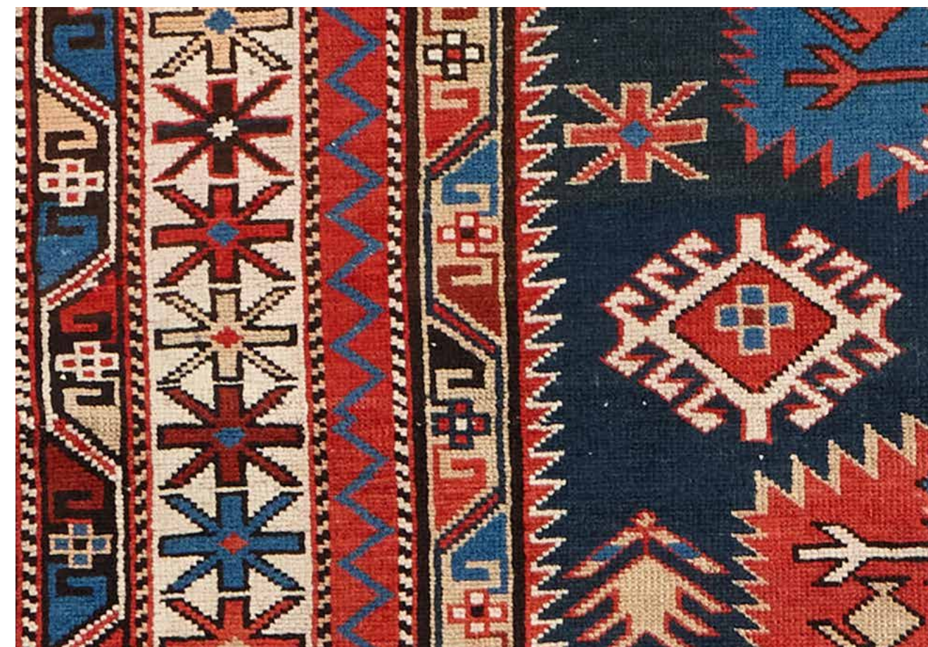
DETAIL LOT 50