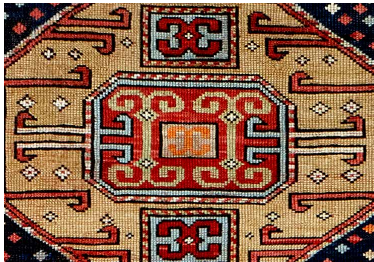
DETAIL LOT 23