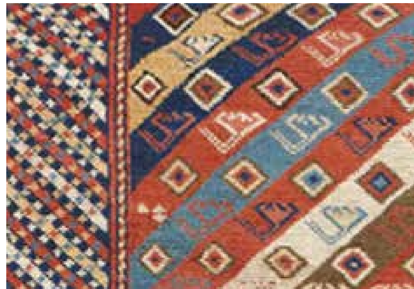
DETAIL LOT 43