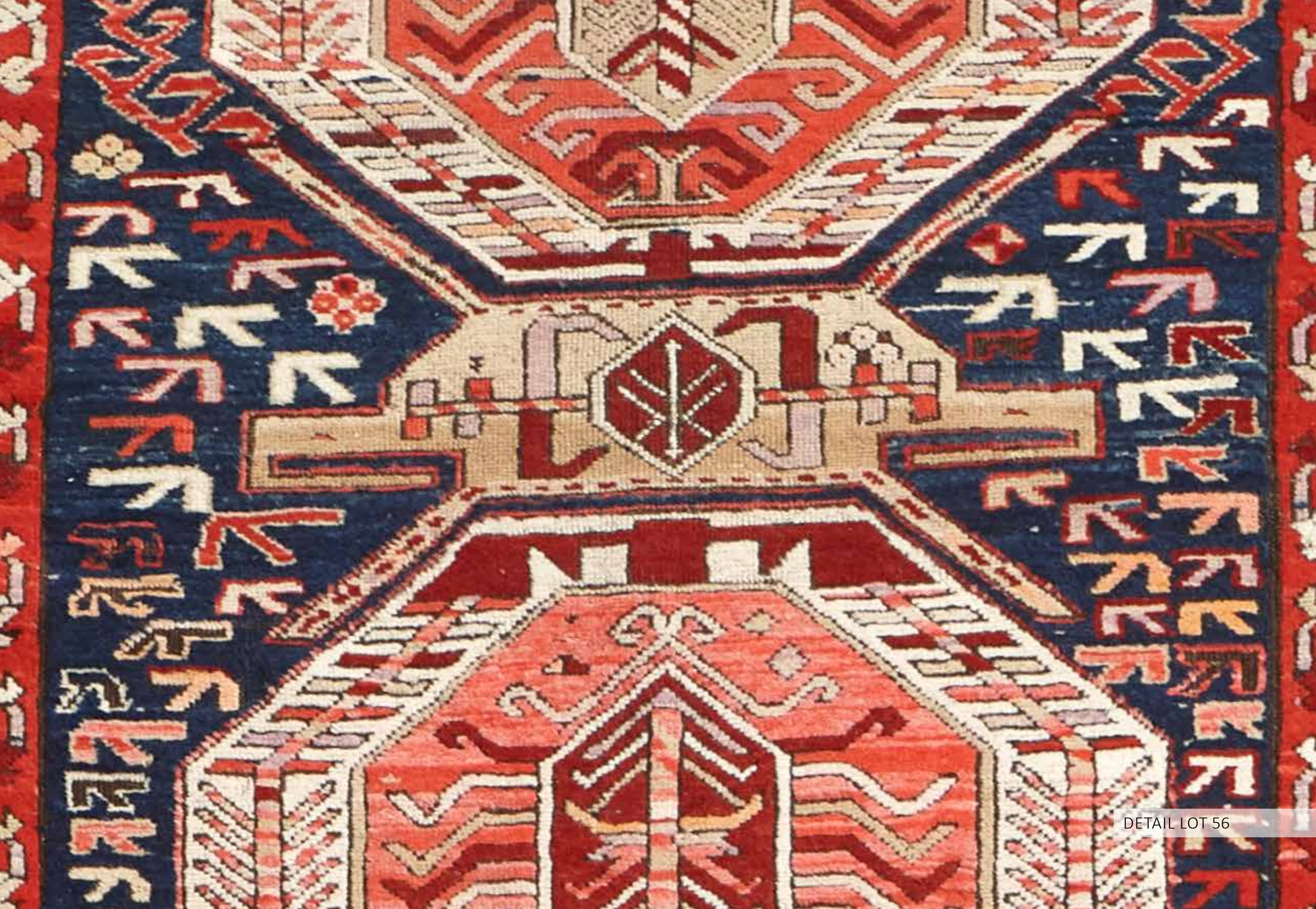
DETAIL LOT 56