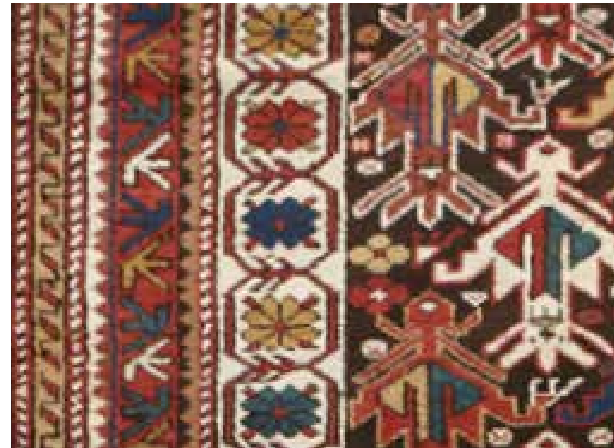
DETAIL LOT 28