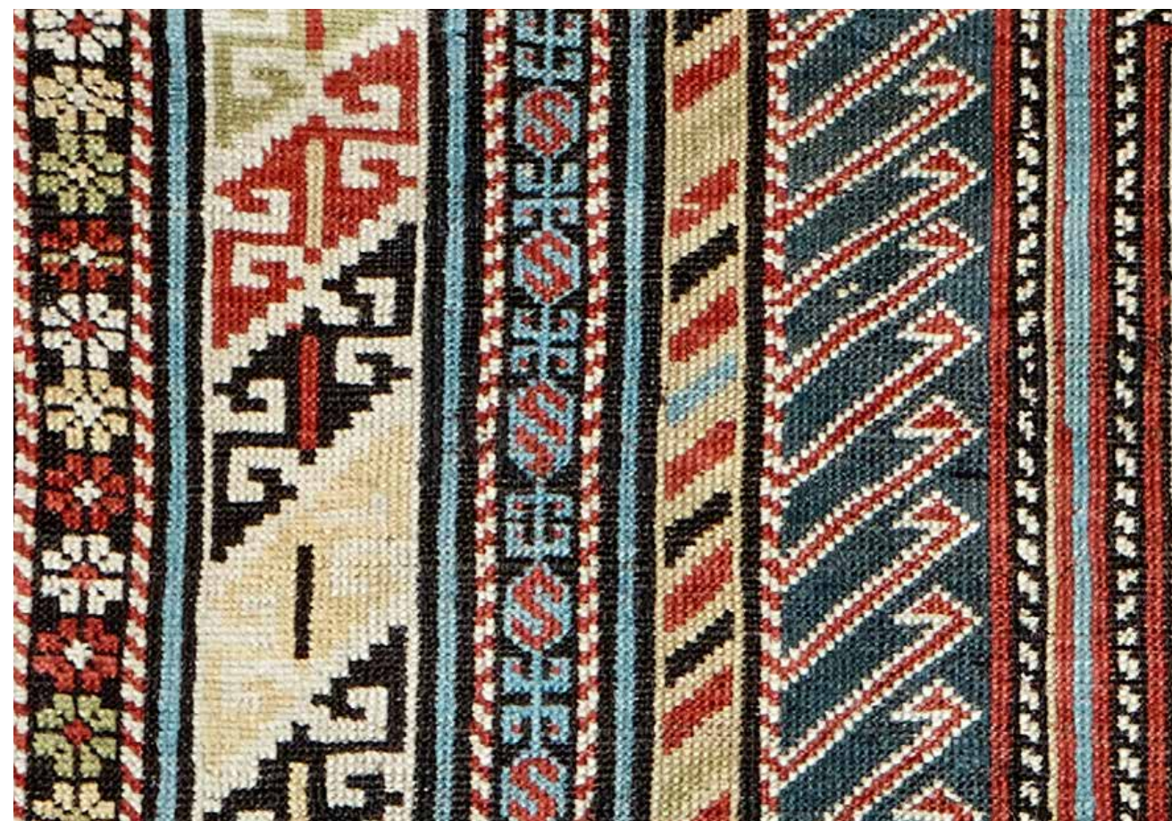
DETAIL LOT 55