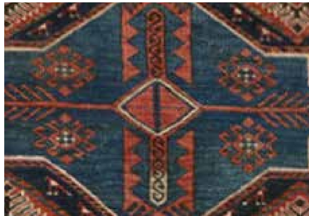
DETAIL LOT 21