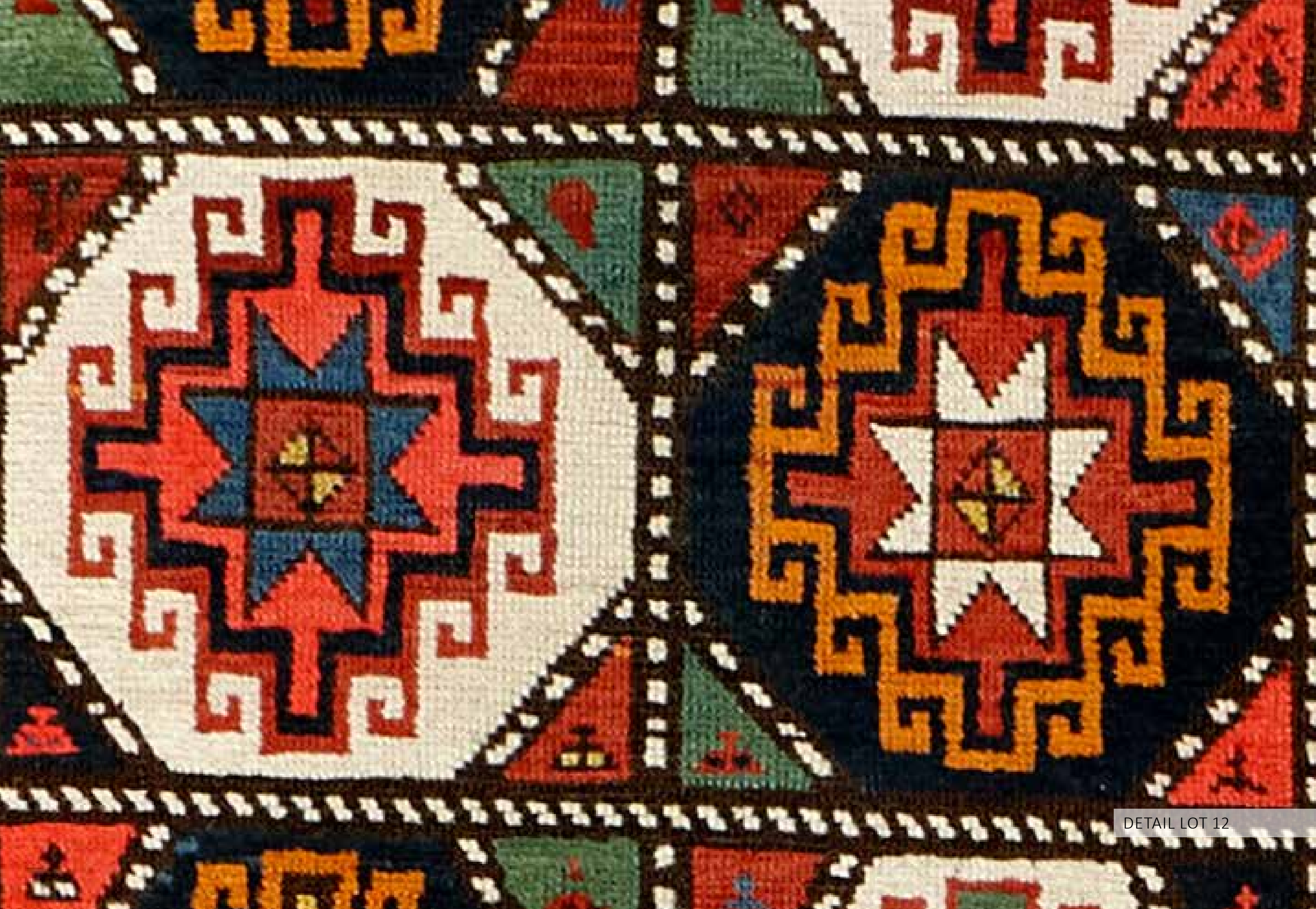
DETAIL LOT 12