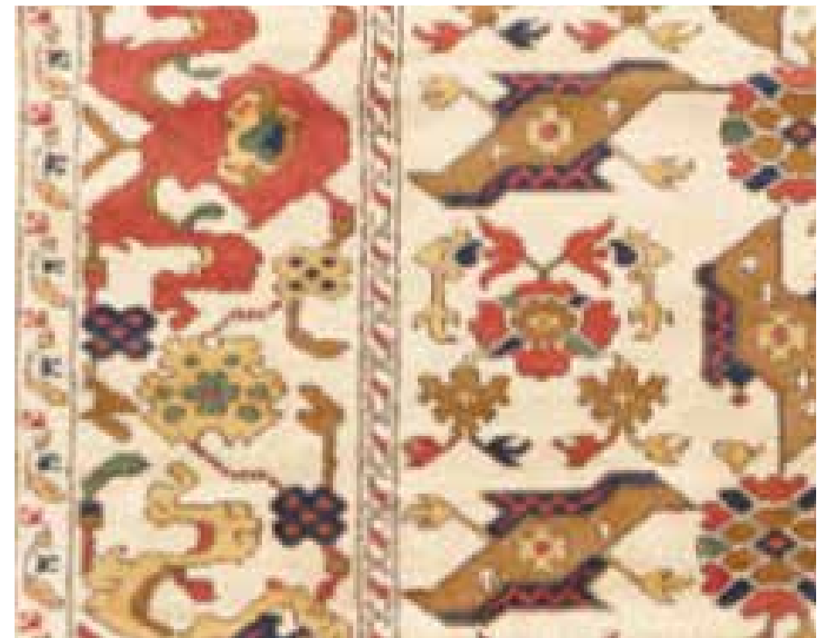
DETAIL LOT 34