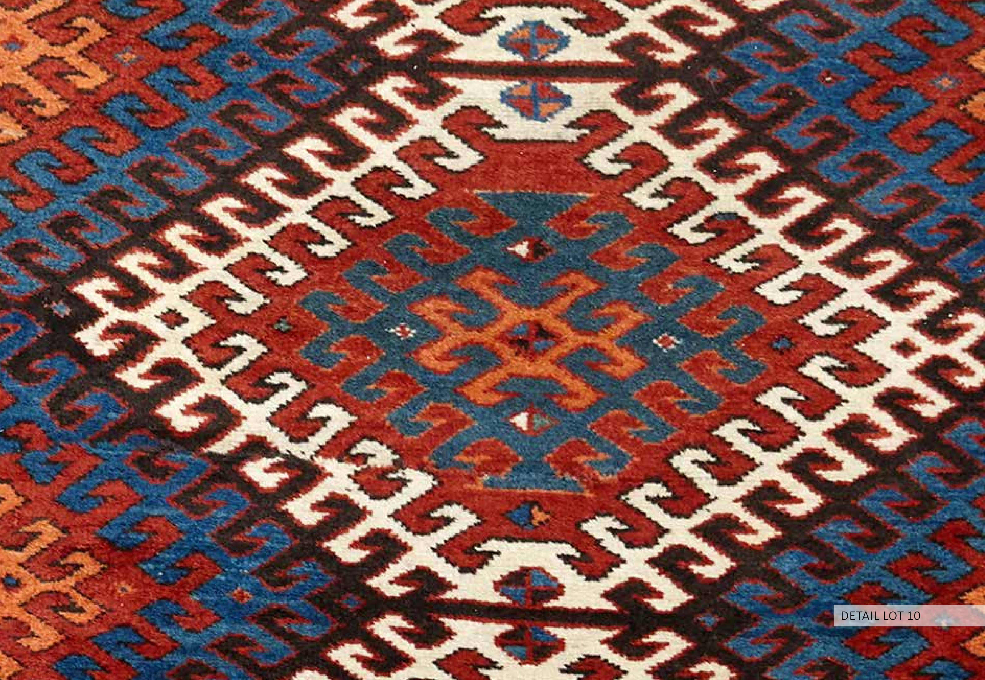
DETAIL LOT 10