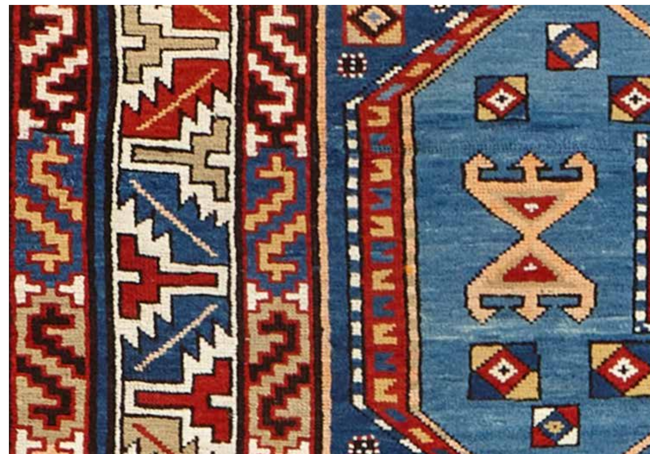
DETAIL LOT 36